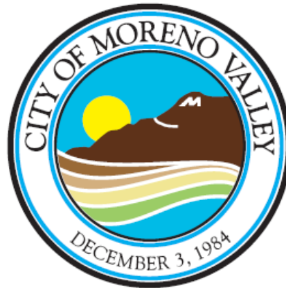
EXHIBIT "A" City of Moreno Valley